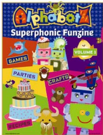
Cover of free Fuzine, at www.alphabotz.com

The Alphabotz will be making their next appearance in Dallas, TX at the annual Fall Toy Preview in October. For those that can't attend the trade show, Alphabotz Superphonic Decoder Cards can be purchased online at www.alphabotz.com and Amazon.com as well as at specialty toy retailers.